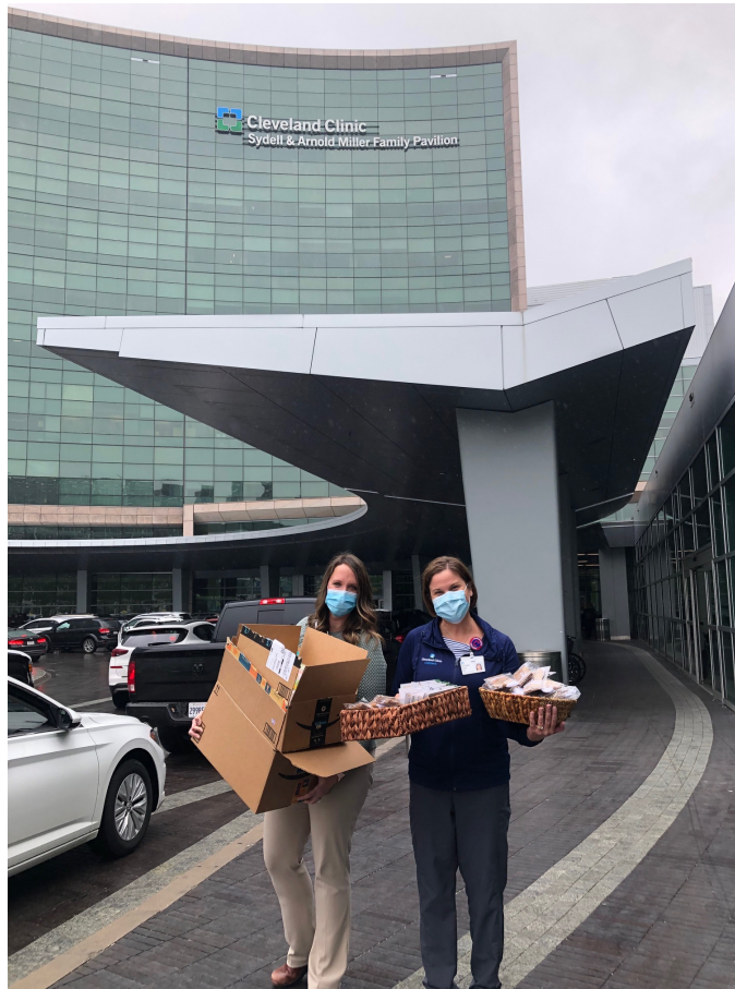
Cleveland Clinic Foundation Caregivers accepting their donations from B Brave Foundation. Due to COVID-19 everything is dropped off outside.