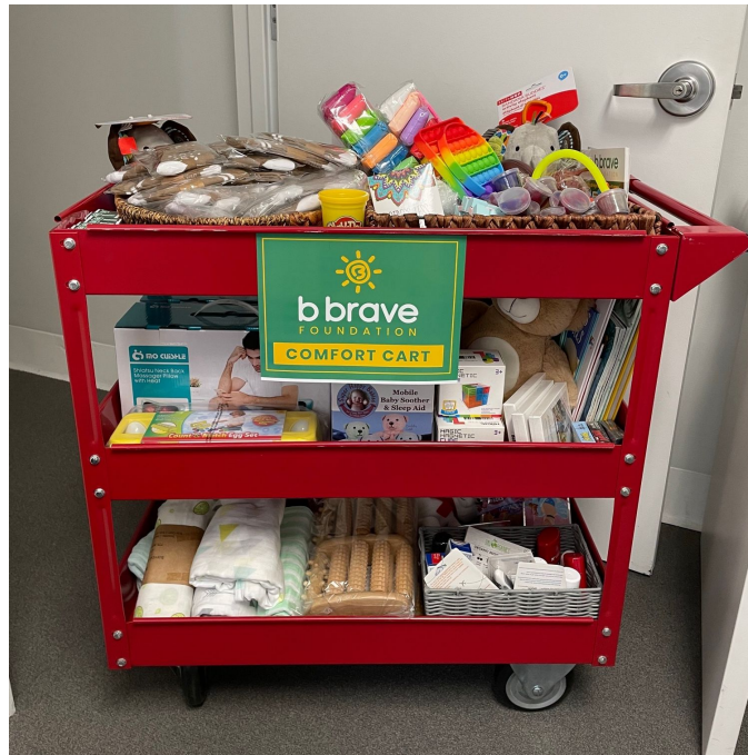
The Famous B Brave Comfort Cart is a big hit around the hospitals. It includes toys, blankets, and snacks for kids to brighten their day!

Patients and families at Cleveland Clinic Children's often spend weeks or months in the hospital. To help them and their parents cope, B Brave created the Comfort Cart. It's filled with interactive toys, games, keepsake items, swaddle blankets, socks, books, lip balms, lotions, meal vouchers, gift cards and other goodies for children and parents to enjoy during their admission and beyond.