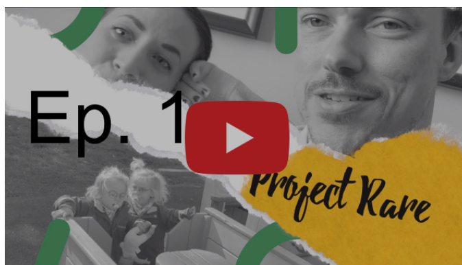
Project Rare - Episode 1

This is an ongoing series and we're working on upcoming films now. Your generosity enables B Brave to educate a wider audience and inspire more people to participate in the transformation of the underfunded rare disease community.